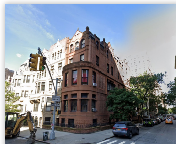
251 WEST 76TH ST