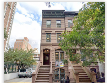
167 WEST 87TH ST