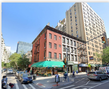
1310 2ND AVE