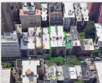
162-164 EAST 82ND ST

*Development Site / Buildable Square Footage