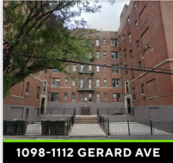
1098-1112 GERARD AVE