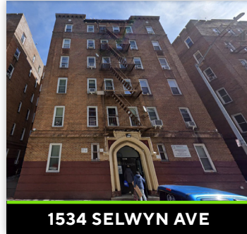
1534 SELWYN AVE