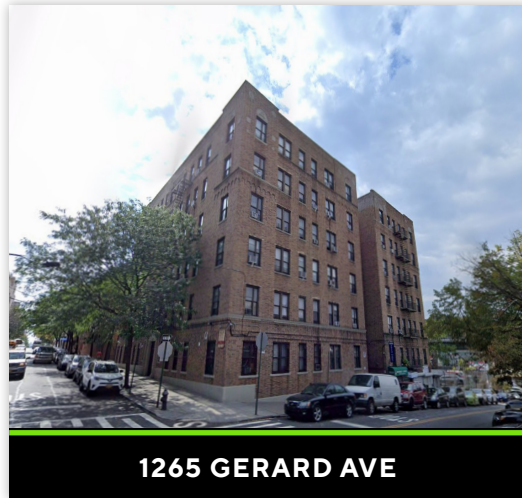
1265 GERARD AVE