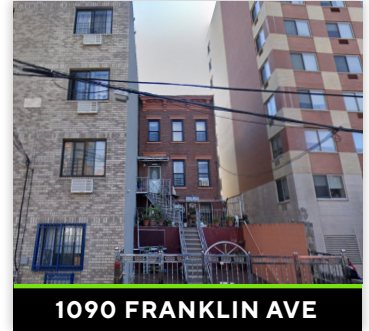
1090 FRANKLIN AVE