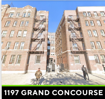
1197 GRAND CONCOURSE