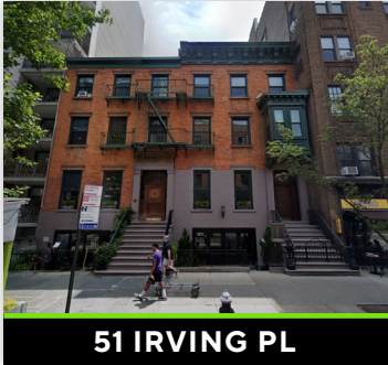
51 IRVING PL