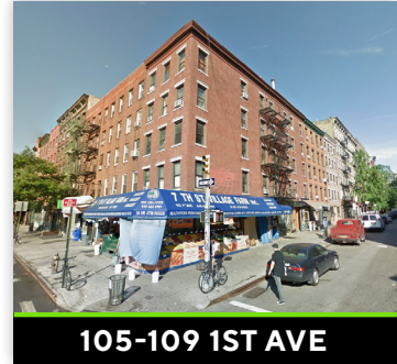
105-109 1ST AVE