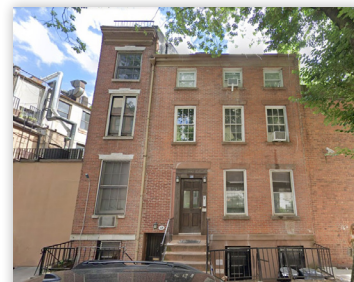
118 CHARLES ST