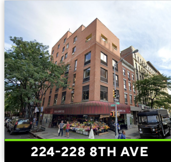
224-228 8TH AVE