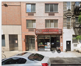
139 EAST 13TH ST