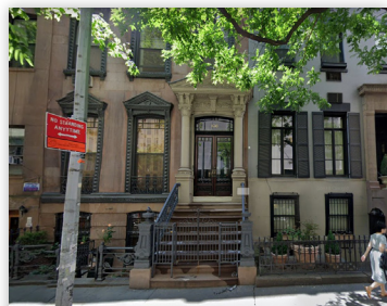
136 EAST 16TH ST