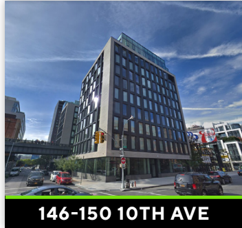
146-150 10TH AVE