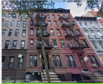
506 EAST 84TH ST