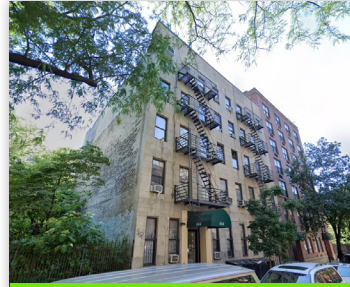
444 WEST 48TH ST