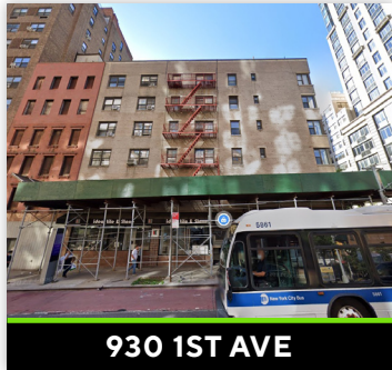
930 1ST AVE