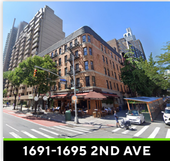
1691-1695 2ND AVE