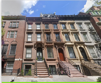
127 EAST 62ND ST