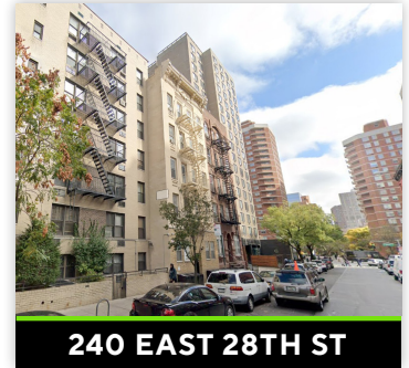
240 EAST 28TH ST