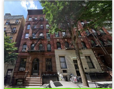
234 EAST 88TH ST