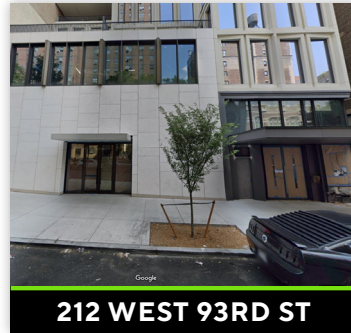
212 WEST 93RD ST