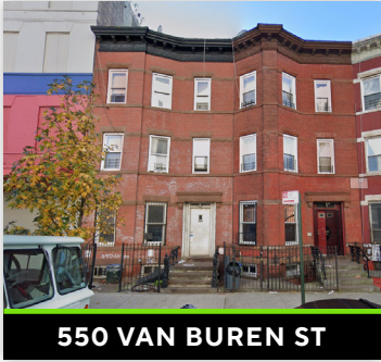
550 VAN BUREN ST