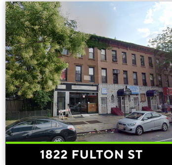
1822 FULTON ST