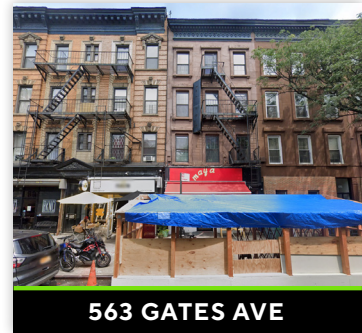
563 GATES AVE