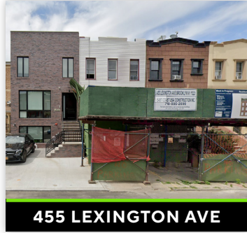
455 LEXINGTON AVE