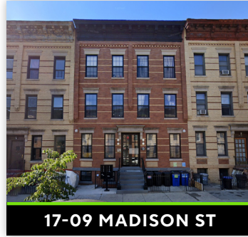
17-09 MADISON ST