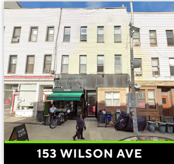
153 WILSON AVE