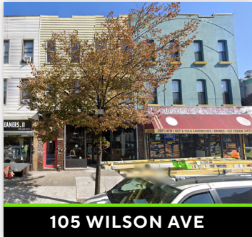
105 WILSON AVE