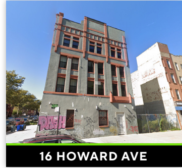
16 HOWARD AVE