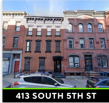
413 SOUTH 5TH ST