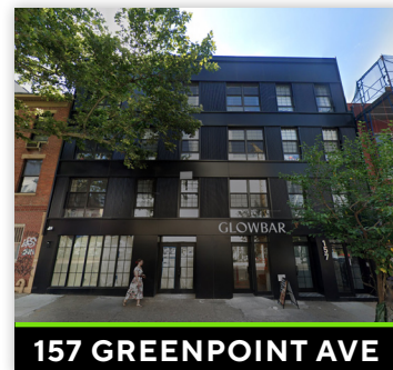
157 GREENPOINT AVE