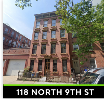
118 NORTH 9TH ST