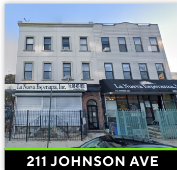
211 JOHNSON AVE