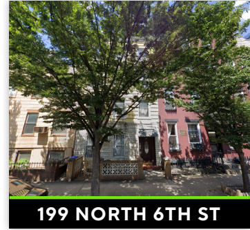
199 NORTH 6TH ST