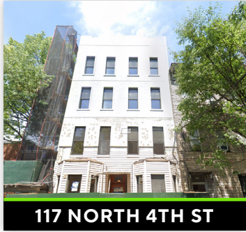
117 NORTH 4TH ST