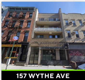
157 WYTHE AVE