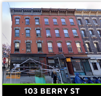
103 BERRY ST