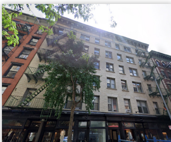
100-104 CHRISTOPHER ST