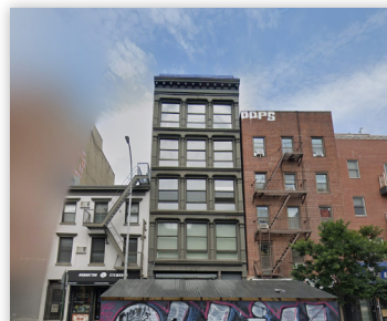
171 1ST AVE