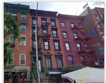
81 EAST 7TH ST