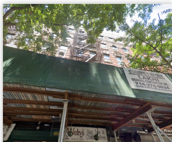
107 CHRISTOPHER ST