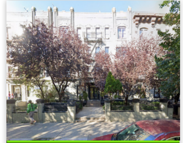
1193-1205 EASTERN PKWY