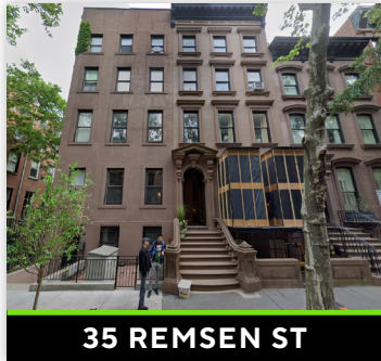
35 REMSEN ST