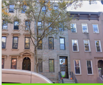
260 PRESIDENT ST