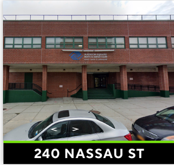
240 NASSAU ST