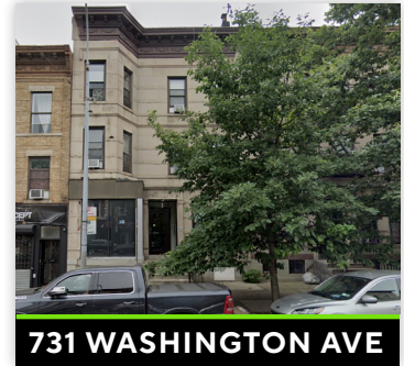
731 WASHINGTON AVE