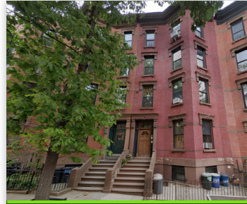
307 HICKS ST