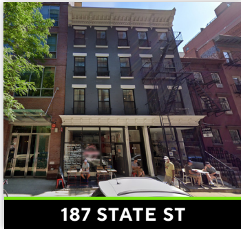
187 STATE ST