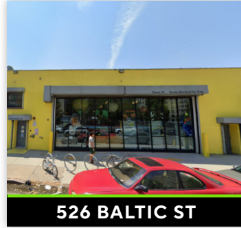
526 BALTIC ST