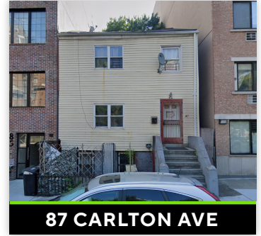
87 CARLTON AVE