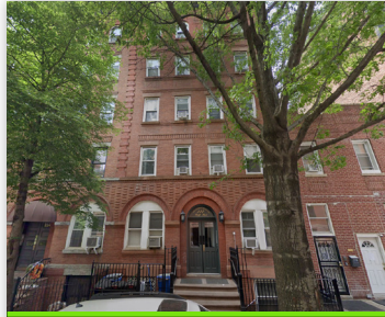
222 PACIFIC ST