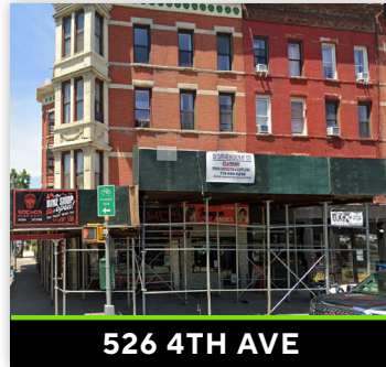
526 4TH AVE