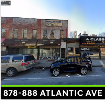
878-888 ATLANTIC AVE