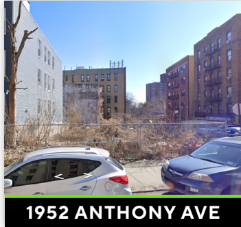
1952 ANTHONY AVE