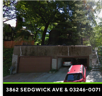
3862 SEDGWICK AVE & 03246-0071