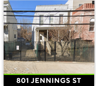
801 JENNINGS ST