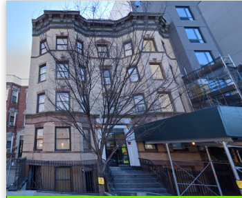
14-16 MOUNT HOPE PL