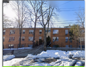
5421 SYLVAN AVE