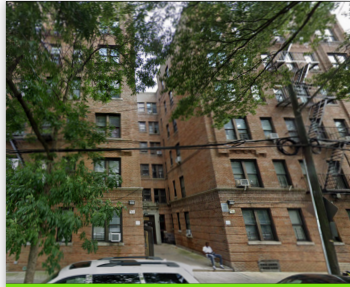
4030 BRONX BLVD