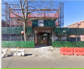
751 ROSEDALE AVE