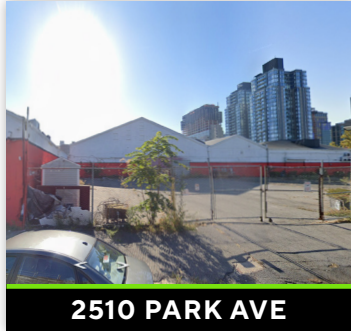
2510 PARK AVE