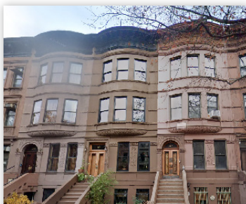
215 WEST 137TH ST