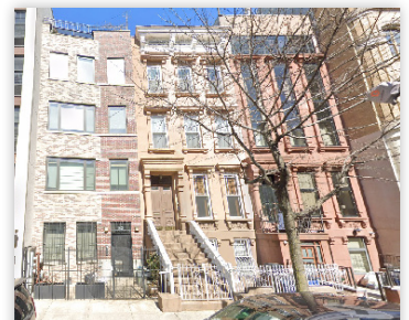
141 WEST 123RD ST