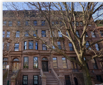
128 WEST 121ST ST