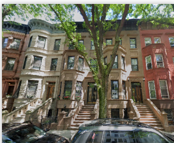
115 WEST 120TH ST