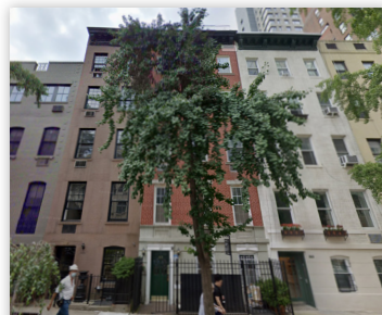
312 EAST 51ST ST