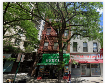
1422 2ND AVE