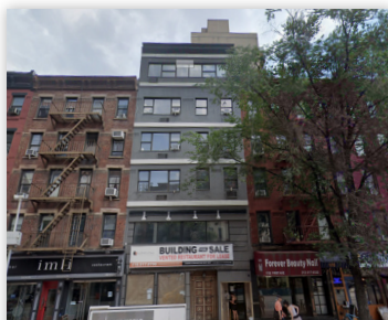
1134 1ST AVE