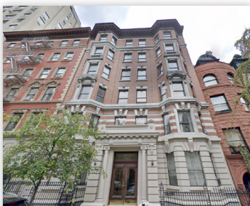
310 WEST 80TH ST