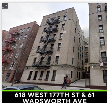
618 WEST 177TH ST & 61 WADSWORTH AVE