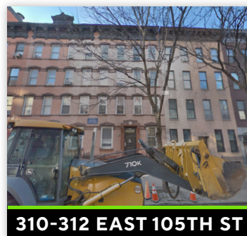
310-312 EAST 105TH ST