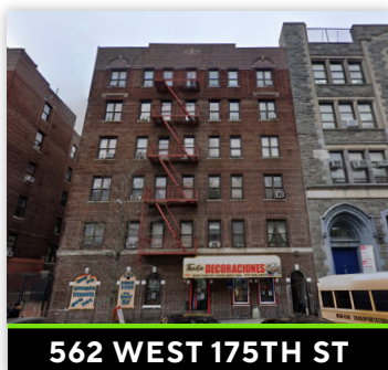
562 WEST 175TH ST