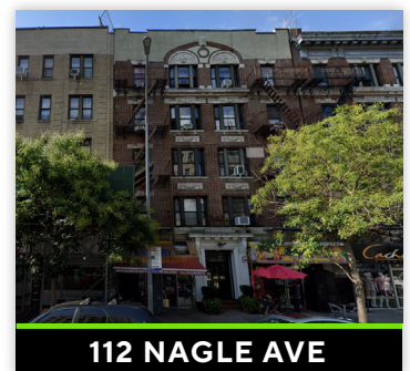
112 NAGLE AVE