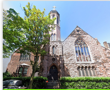
232 ADELPHI ST