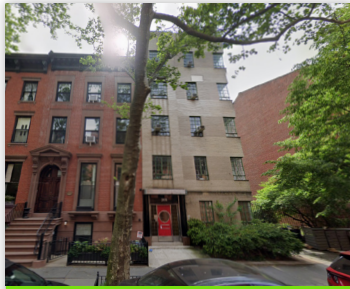
269 HENRY ST