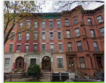
186 SAINT MARKS AVE