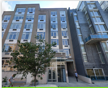
97 GRAND AVE