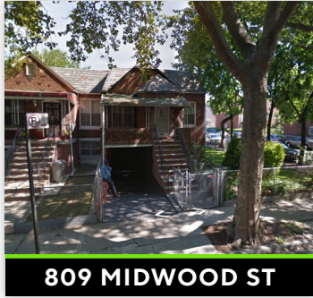
809 MIDWOOD ST