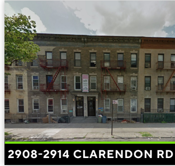
2908-2914 CLARENDON RD