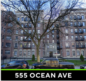
555 OCEAN AVE