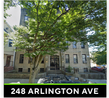
248 ARLINGTON AVE