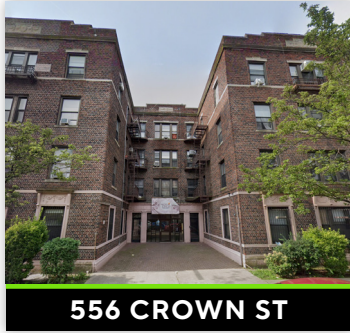
556 CROWN ST