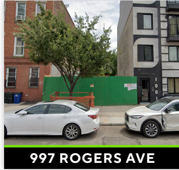
997 ROGERS AVE