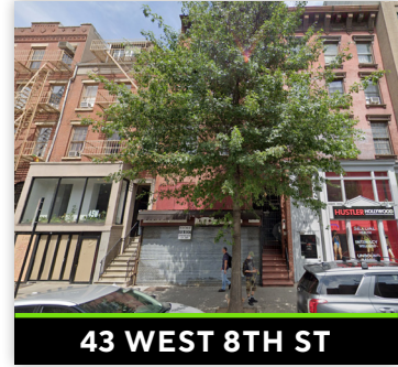
43 WEST 8TH ST