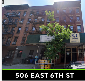
506 EAST 6TH ST