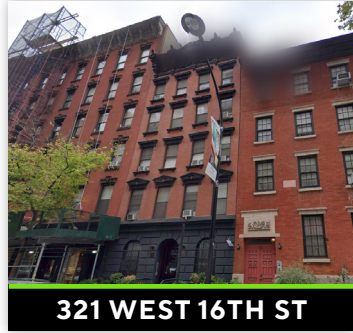
321 WEST 16TH ST