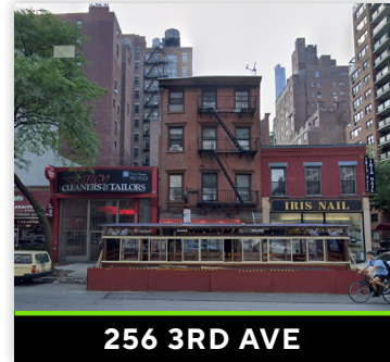
256 3RD AVE