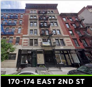
170-174 EAST 2ND ST