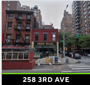
258 3RD AVE