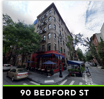
90 BEDFORD ST