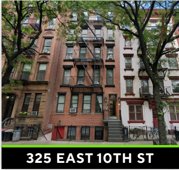
325 EAST 10TH ST