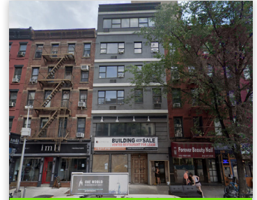
1134 1ST AVE