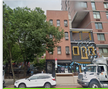
529 2ND AVE