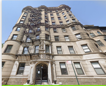
120-125 RIVERSIDE DRIVE