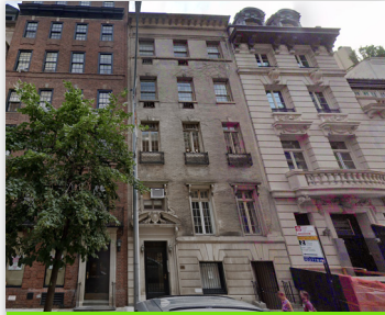
18 EAST 67TH ST