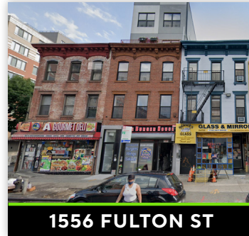
1556 FULTON ST