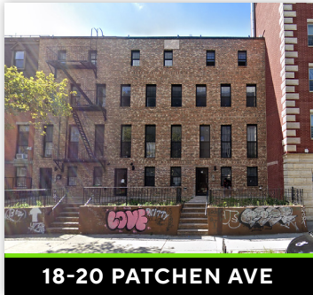
18-20 PATCHEN AVE