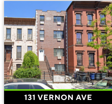
131 VERNON AVE