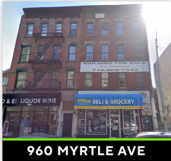
960 MYRTLE AVE