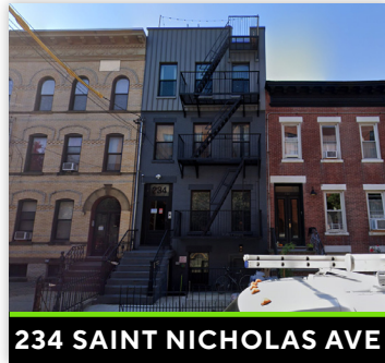
234 SAINT NICHOLAS AVE