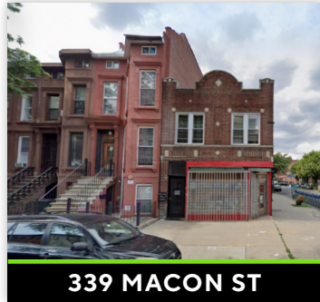
339 MACON ST