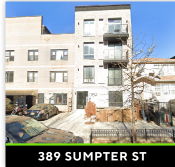
389 SUMPTER ST