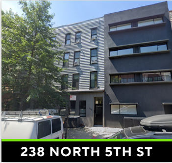
238 NORTH 5TH ST