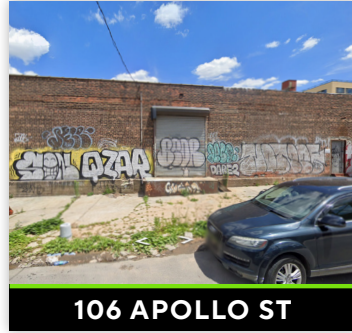
106 APOLLO ST