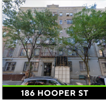
186 HOOPER ST