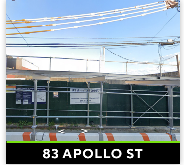
83 APOLLO ST