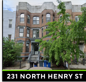
231 NORTH HENRY ST