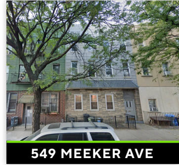
549 MEEKER AVE