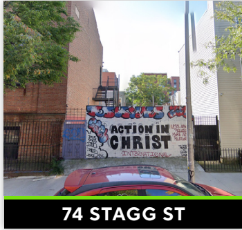
74 STAGG ST