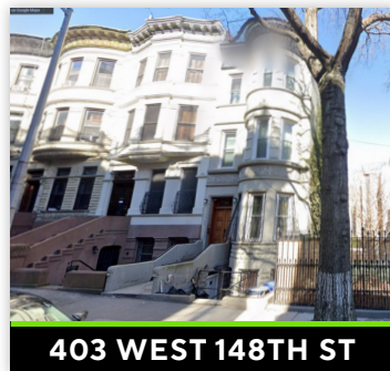
403 WEST 148TH ST