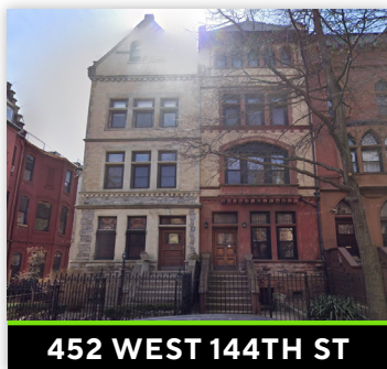
452 WEST 144TH ST