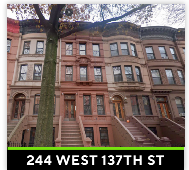
244 WEST 137TH ST