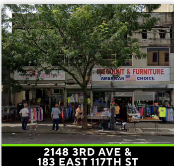
2148 3RD AVE & 183 EAST 117TH ST