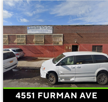
4551 FURMAN AVE