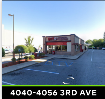
4040-4056 3RD AVE