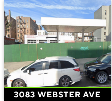
3083 WEBSTER AVE