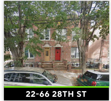
22-66 28TH ST