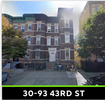
30-93 43RD ST