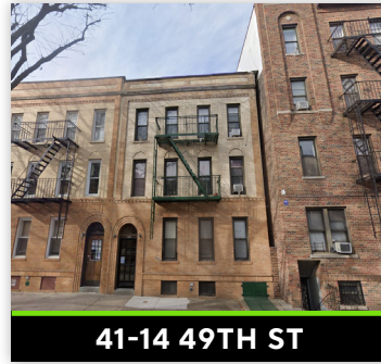
41-14 49TH ST