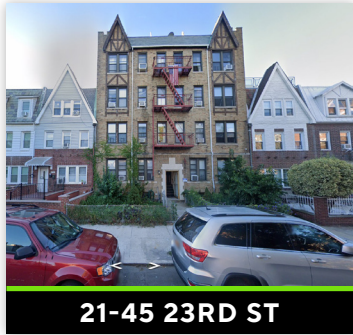
21-45 23RD ST