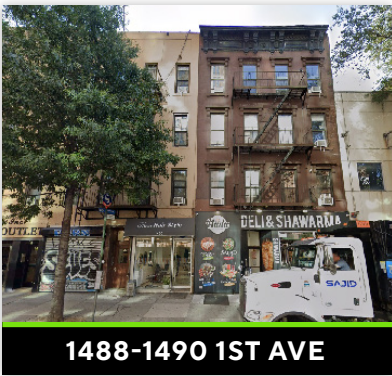
1488-1490 1ST AVE