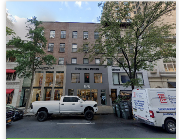
958 MADISON AVE