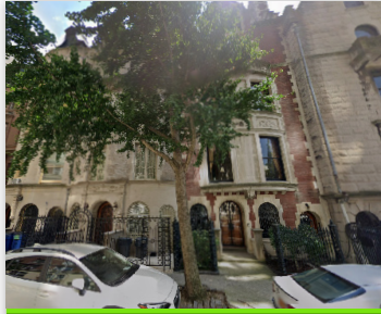
318 WEST 81ST ST