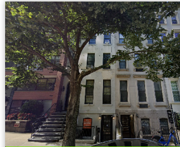
164 EAST 61ST ST