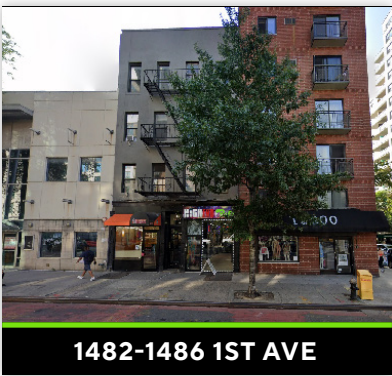
1482-1486 1ST AVE