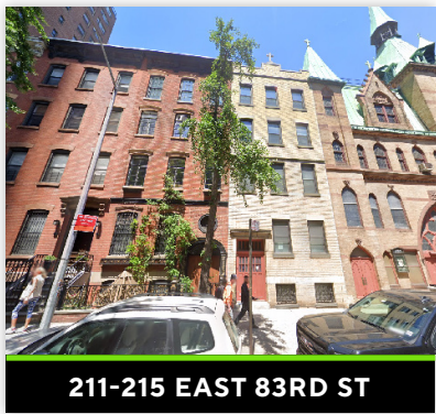
211-215 EAST 83RD ST