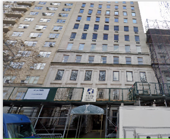
944 5TH AVE