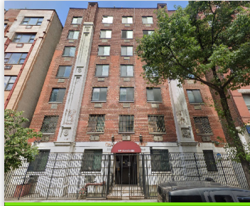
359 WEST 48TH ST