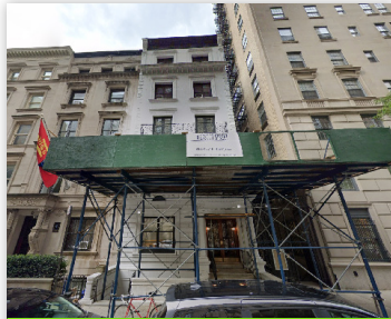
4 EAST 77TH ST