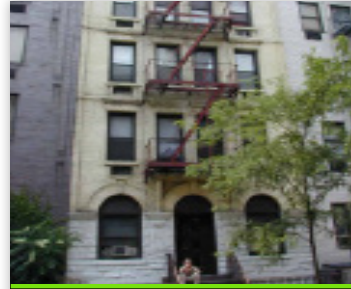
418 EAST 81ST ST