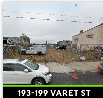
193-199 VARET ST