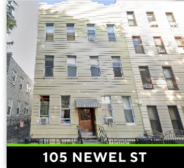
105 NEWEL ST