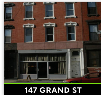
147 GRAND ST