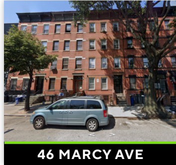
46 MARCY AVE