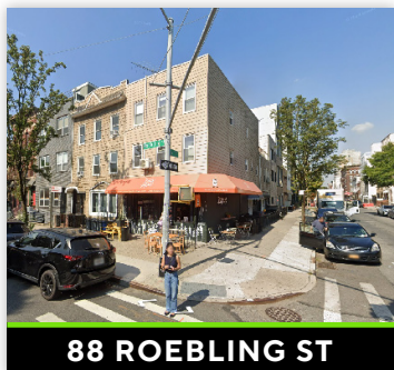
88 ROEBLING ST