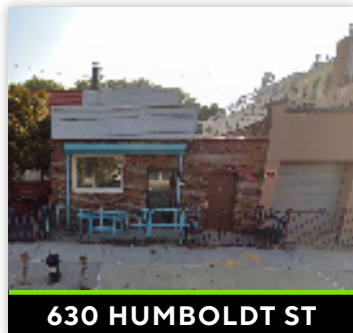
630 HUMBOLDT ST