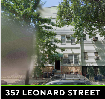
357 LEONARD STREET