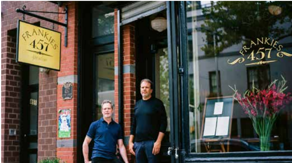
Frankies 457 Spuntino